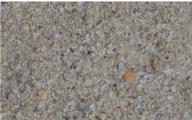
Soybean hulls.

\beta -mannans are typically known for their structures' resistance to solubility that creates high viscosity in feed and therefore promotes anti-nutritive properties in animal feeds (Chauhan et al., 2012), especially in non-ruminant species such as poultry