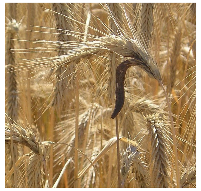
Ergot ( Claviceps purpurea ) sclerotium in rye ( Secale cereale ).

The sign of ergot is the dark purple to black sclerotia (ergot bodies) which replace the grain in the heads of cereals and grasses just prior to harvest. The ergot bodies consist of a mass of vegetative strands of the fungus.