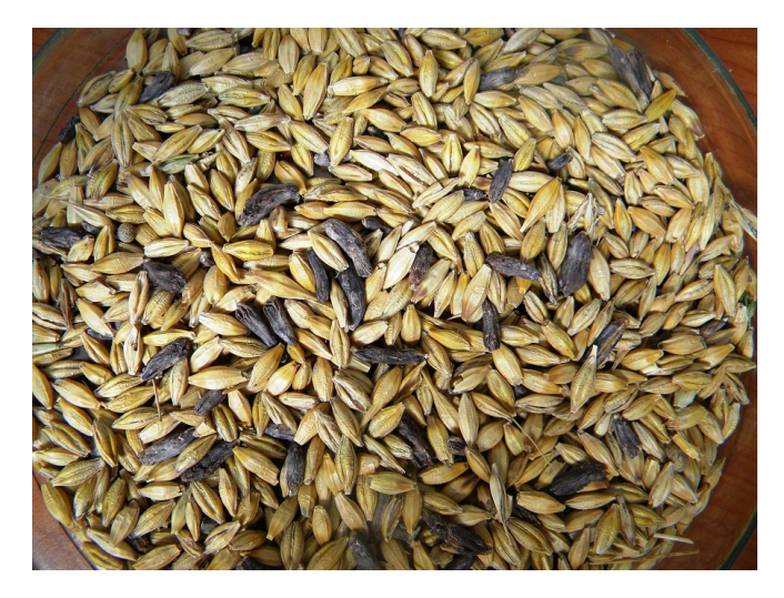
Barley grains contaminated by ergot ( Claviceps purpurea ).

as wheats, grain kernels and the ergot bodies may be almost similar in size.